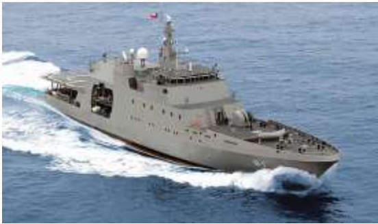
Fassmer - German