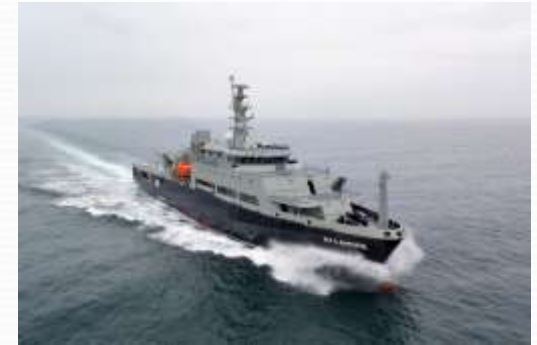
Damen - Dutch

3 shortlist designers SEA 1180 Offshore Patrol Vessel (OPV)