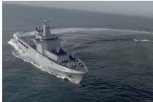
Luerssen - German