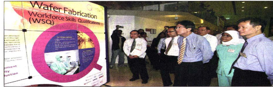
Labour chief Lim Swee Say (foreground, third from right) at the launch of the new initiative developed under the Workforce Skills Qualifications framework. With him is NTUC deputy secretary-general Halimah Yacob.